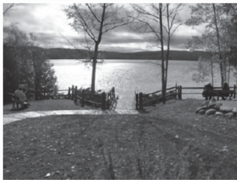
Park at Resort Pike Rd