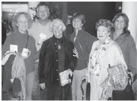
The Hursley Family